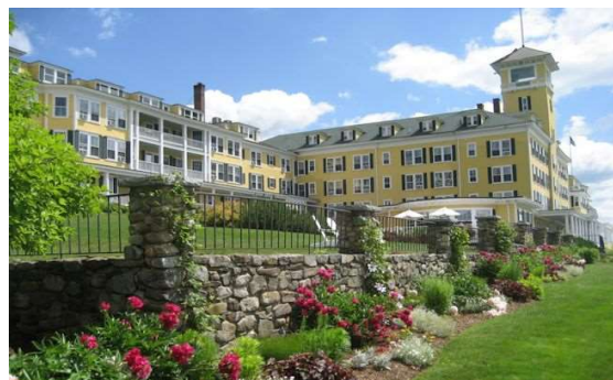
Mountain View Grand Resort & Spa