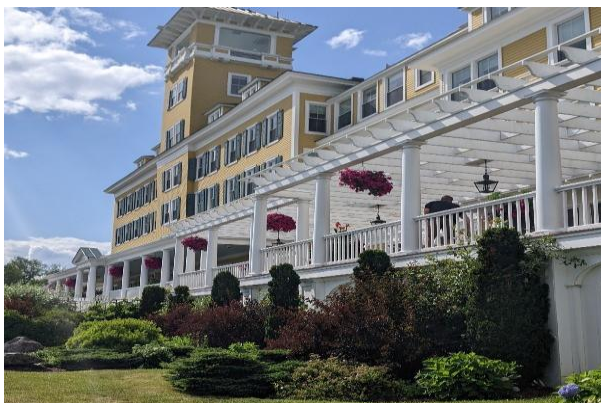
Mountain View Grand

Day 1. Fall is in the air so let's follow the colors north into New England where the charming town of Shelburne Falls is nestled in the foothills of the Berkshires. Take a wander along the quaint historic streets where there's a perfect place for a tasty lunch then explore the geological wonders of the Deerfield River where nature artistically carved glacial potholes over the last 14,000 years. Don't miss a stroll along the amazingly colorful Bridge of Flowers with its cheery welcome across a once abandoned trolley bridge. Along our route north, we'll take a dip into Vermont for a special, quirky surprise. A ramshackle representation of a prehistoric beast craftily made from scraps of anything from old lattice and broken bed frames to guitars, crutches, Tiki torches, and toboggans stands proudly among the small Post Mills Airport. Meet Vermontasaurus, a whimsical creation from one man's wild imagination. Soon we will be among the elegance of