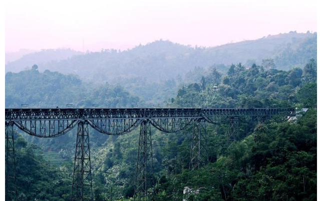
Kinzua Skywalk Bridge