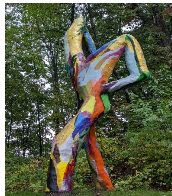
de Cordova Sculpture