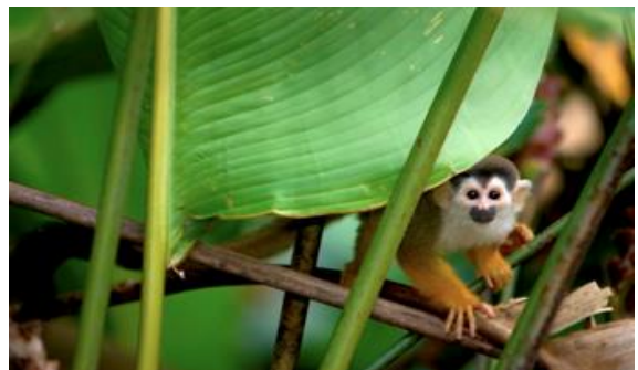
Wildlife on Osa Peninsula